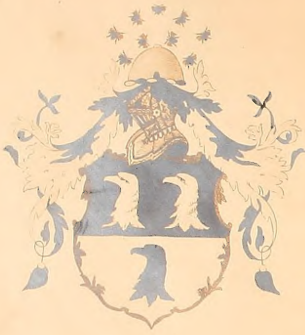
Arms of Hunnewell.